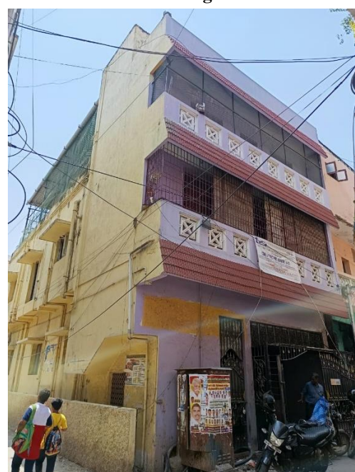
Elevation & Car Parking